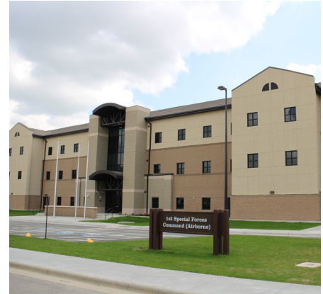
SOF Group Headquarters