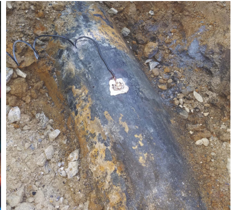
Wilde Lake, Water Main Study & Rehabilitation

EDT's corrosion engineering staff includes registered professional engineers and National Association of Corrosion Engineers (NACE) certified corrosion specialists.