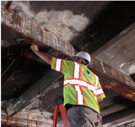
Baltimore Food Hub