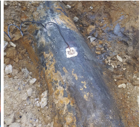
Wilde Lake, Water Main Study & Rehabilitation

EDT's corrosion engineering staff includes registered professional engineers and National Association of Corrosion Engineers (NACE) certified corrosion specialists.